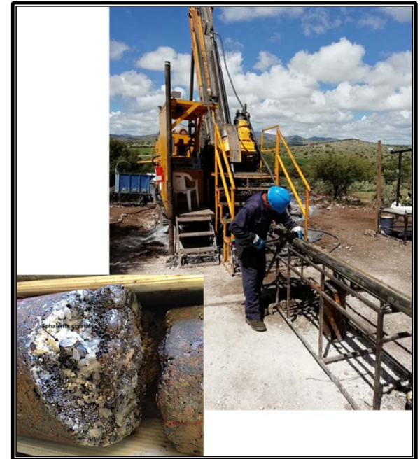
High-grade Drill Core and Drilling at SSV's Cerro Las Minatas Project, Durango, Mexico