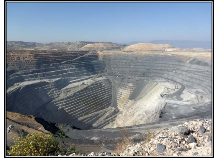
Penasquito Mine, Zacatecas, Mexico

2011: Cerro Las Minitas discovery, Mexico