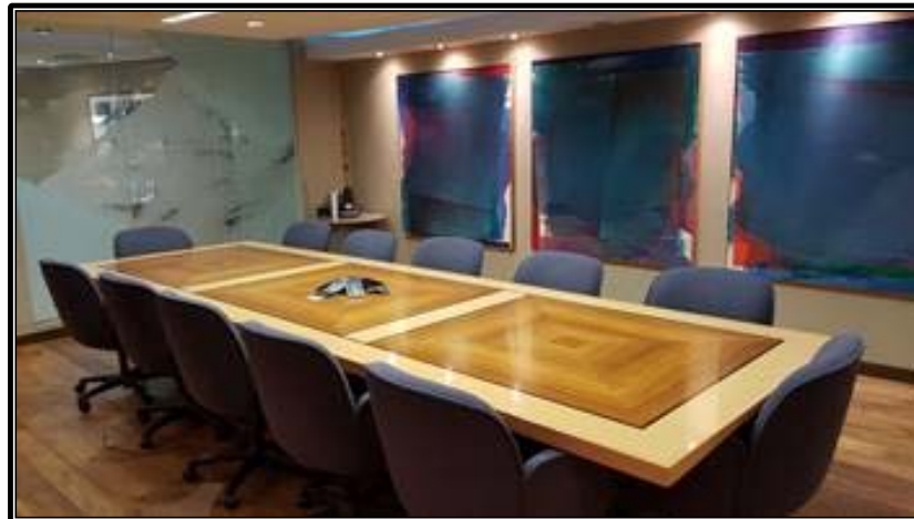
Our Boardroom - Offering a professional environment that is fully equipped with videoconference technology Tea, Coffee and Water as well as lunch if requested is provided for all meetings