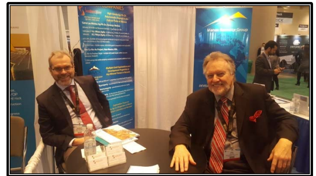
The Manex team in action at PDAC 2019